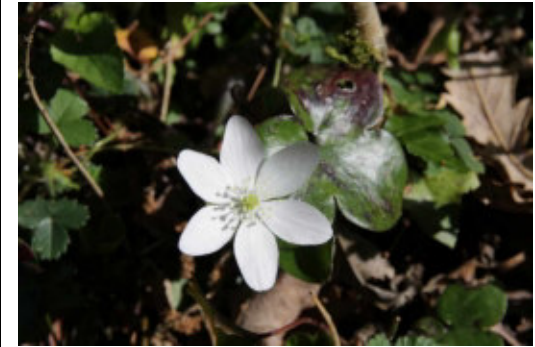
Anemone hepatica L.