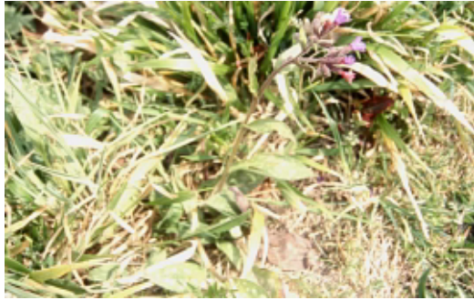
Pulmonaria affinis Jord.