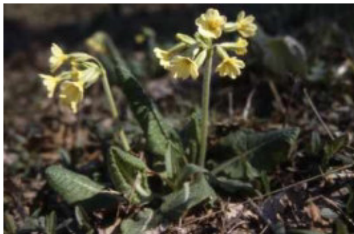
Primula elatior (L.) Hill