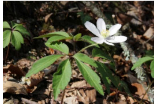
Anemone sylvestris L.