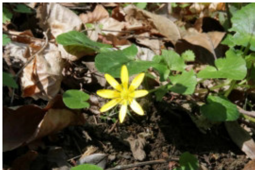
Ficaria verna Huds.